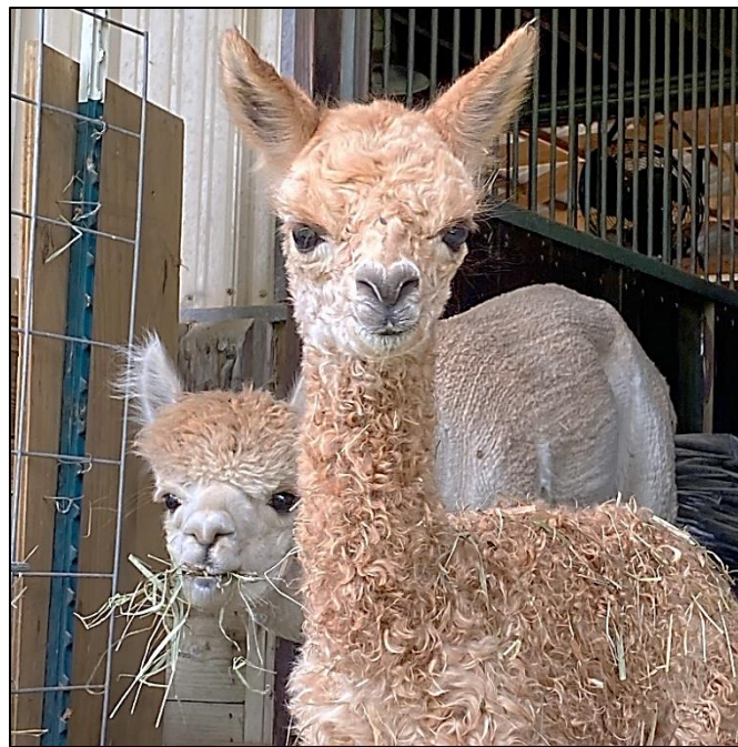
ALPACAS FROM THE PLUMERIA ALPACA RANCH

I s the Holy Spirit guiding Christ Lutheran's call process? I believe so. Can Christ Lutheran weather the next chapter in the call committee's process. I believe so.