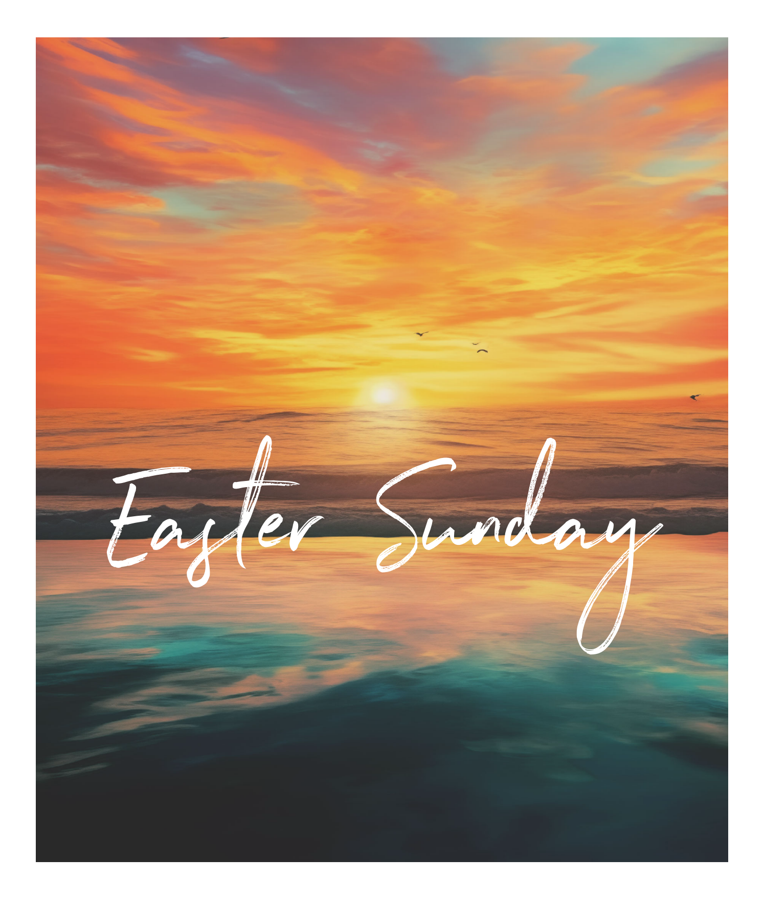
Christ Lutheran Church March 31, 2023